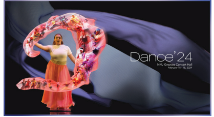
Dance '24 Feb 16-18, 2024 NKU Greaves Concert Hall